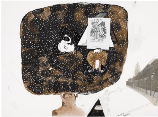
Black Oak