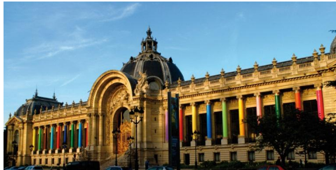
The Petit Palais museum dressed up with Cansn Vivaldi paper